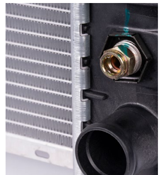
Steel crimp strips give a stronger seal & prevent leaks