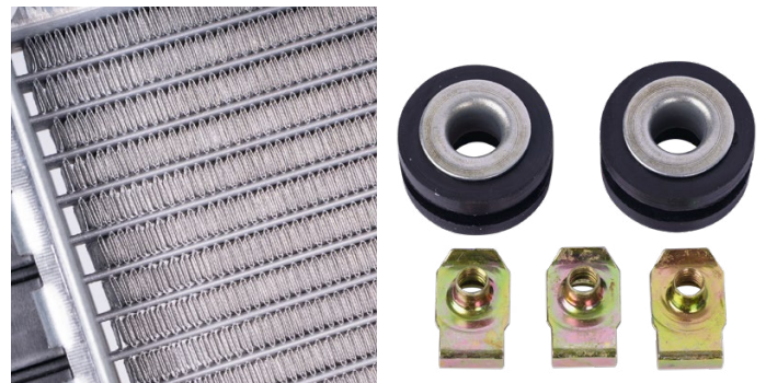
More fins. Maximum airflow. Lower temps. Peak performance.